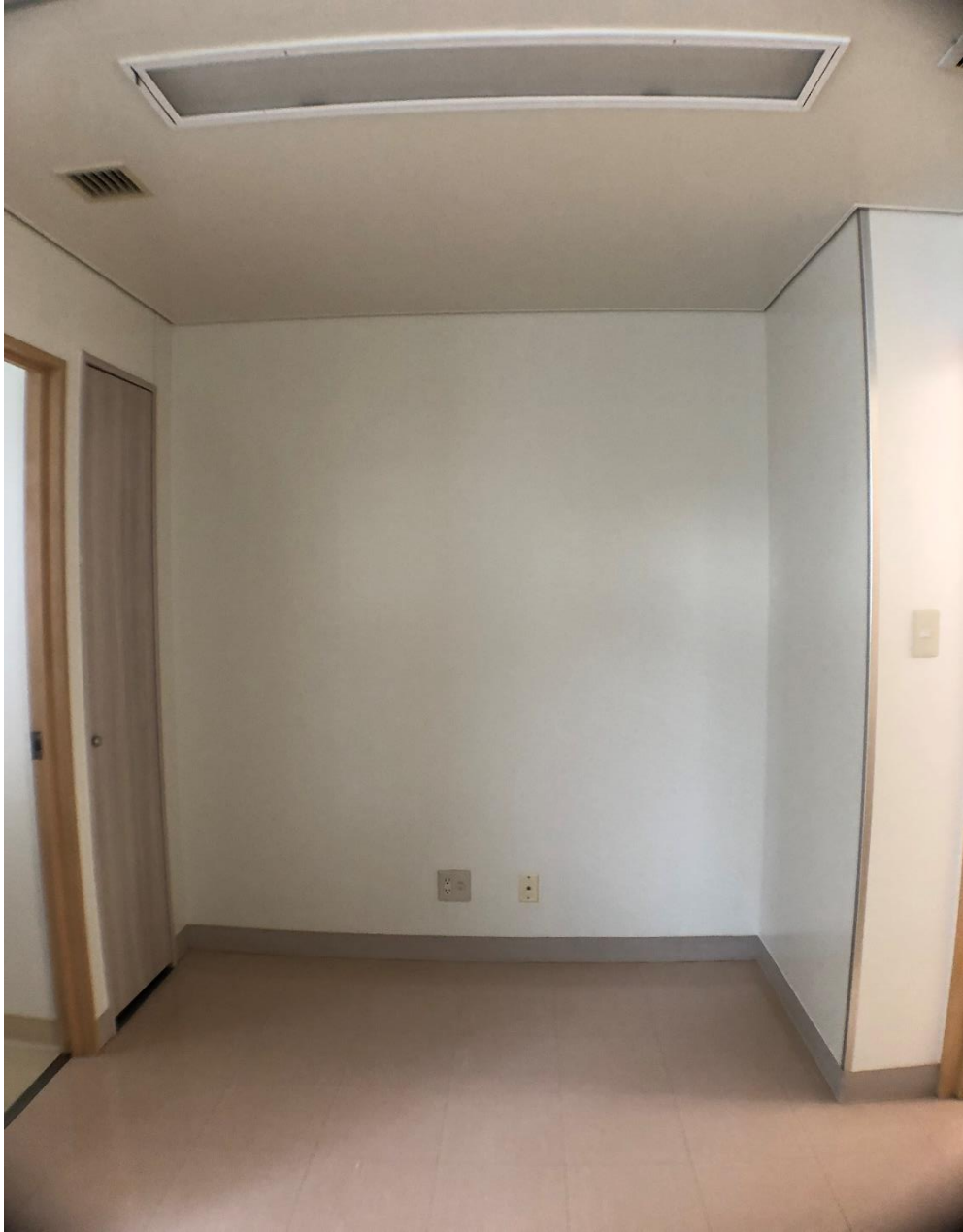
Space next to the kitchen