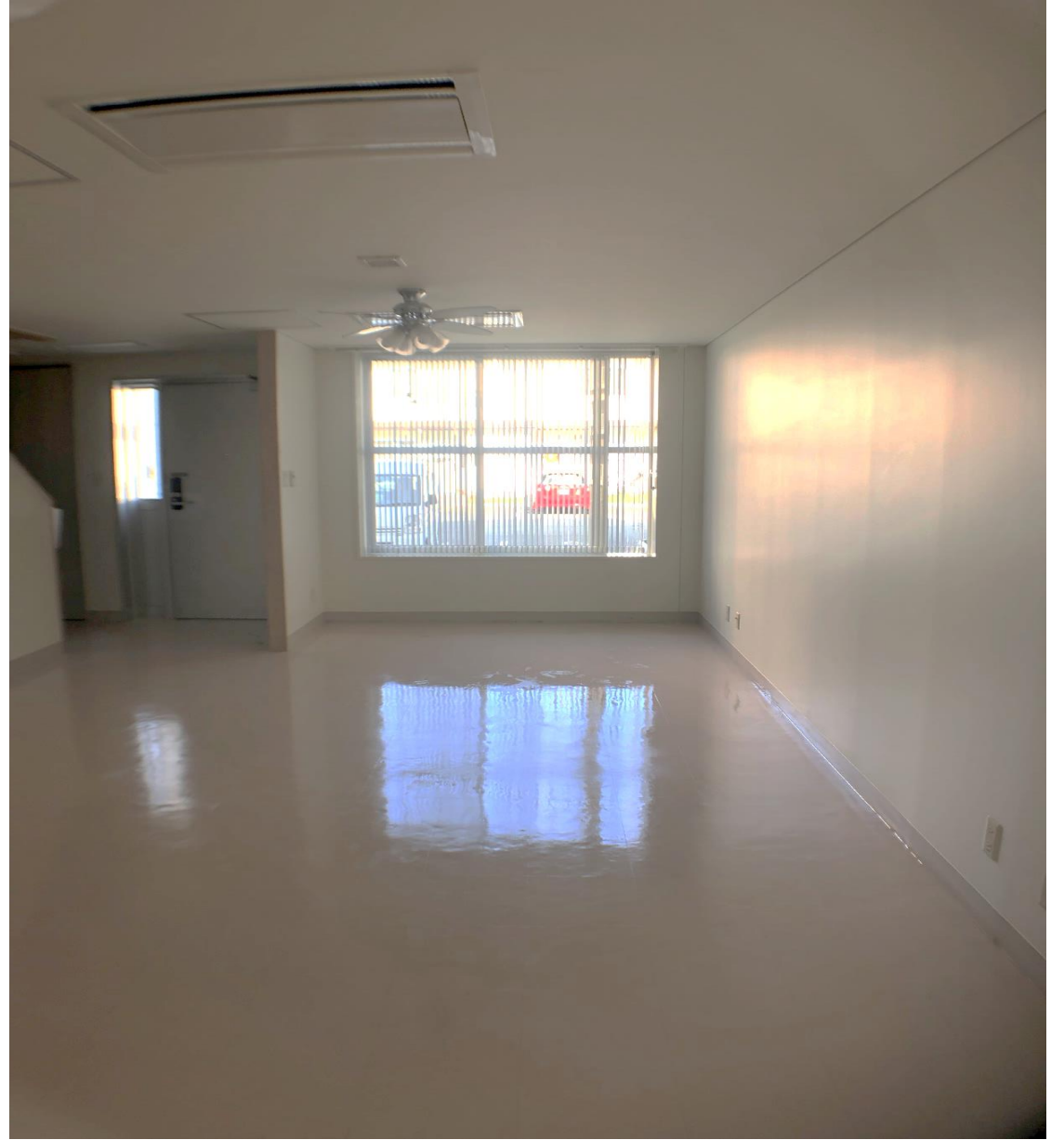
Living Dining Room